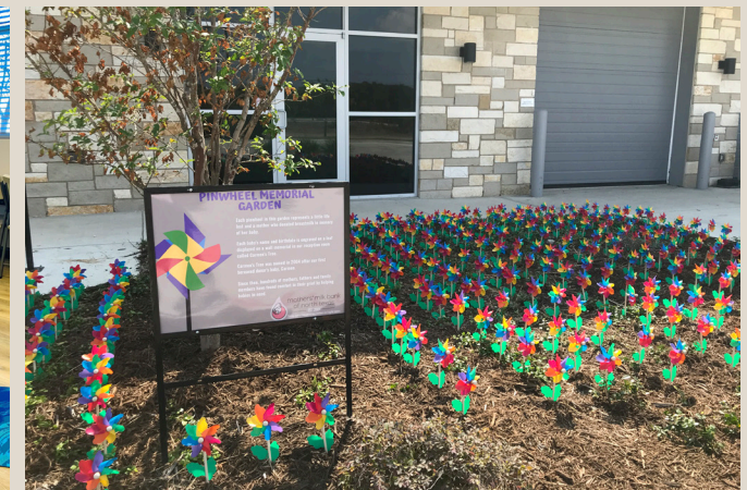
Pinwheel garden in remembrance of little lives lost