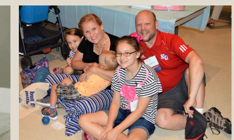
Family Expo & Big Latch On