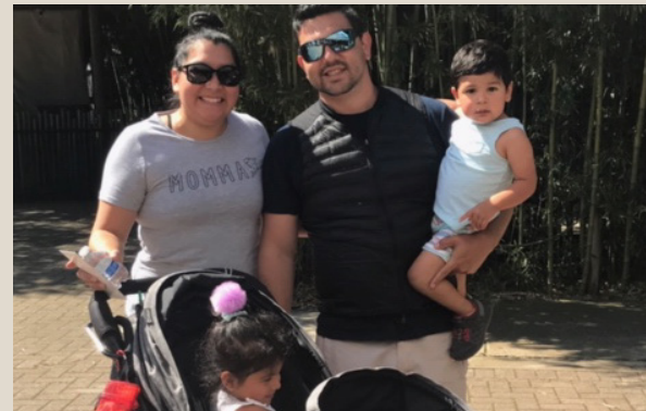
New donor appreciation day at Fort Worth Zoo