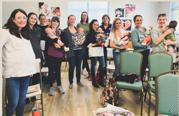
Infant sleep class in the new community room