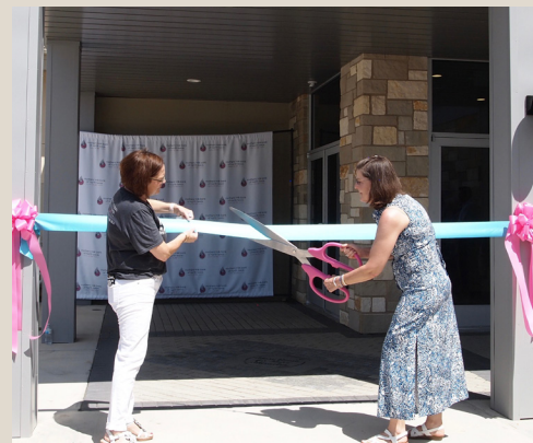
New building Grand Opening Celebration