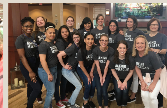
Team MMBNT in Chicago at HMBANA's Milk Matters Symposium in April