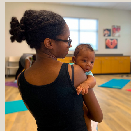
Mom & Baby Yoga class in the new community room