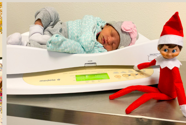
Elf on the Shelf checking a baby's weight