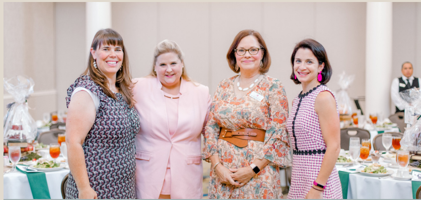
15th Anniversary Luncheon