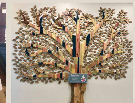
The new Carmen's Tree memorial featuring original leaves