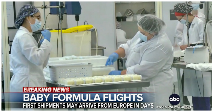
ABC World News tonight with David Muir aired a live story about the formula shortage on Friday, May 20 from outside our milk processing lab window.